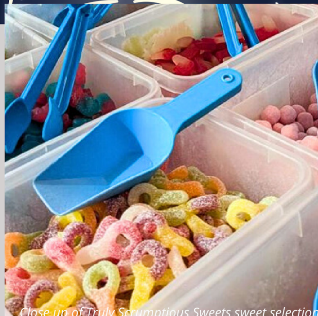
Close up of Truly Scrumptious Sweets sweet selection

Don't miss getting a top up of your favourite sweets, Truly Scrumptious Sweets will be in The Lumen reception, 10:30 - 14:30 on Monday 15th January