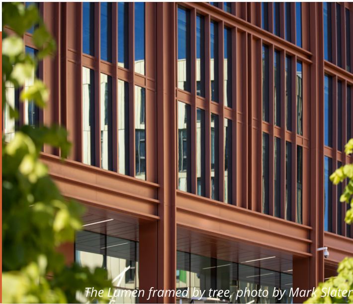
The Lumen framed by tree